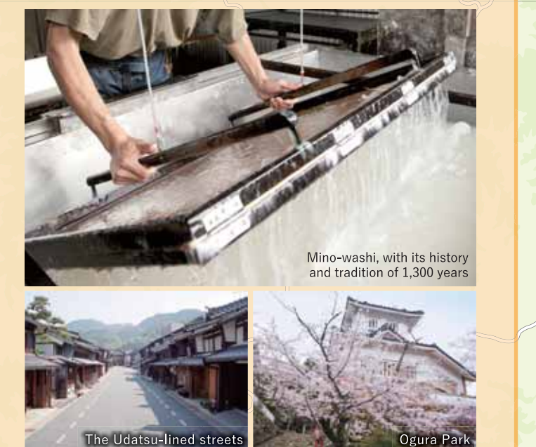
Mino-washi, with its history and tradition of 1,300 years