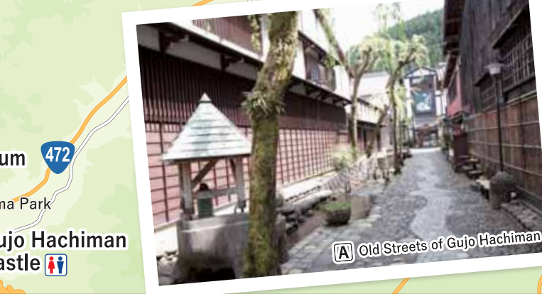
Old Streets of Gujo Hachiman

From Gujo Hachiman Castle, which stands atop the mountain, one can walk to what is said to be a town of craftspeople & blacksmithing and experience the traditional streets with their unique atmosphere and water channels. This town which plays host to many stores, both old and new, holds "all-night dancing" in the summer and attracts peoples' hearts throughout the year.